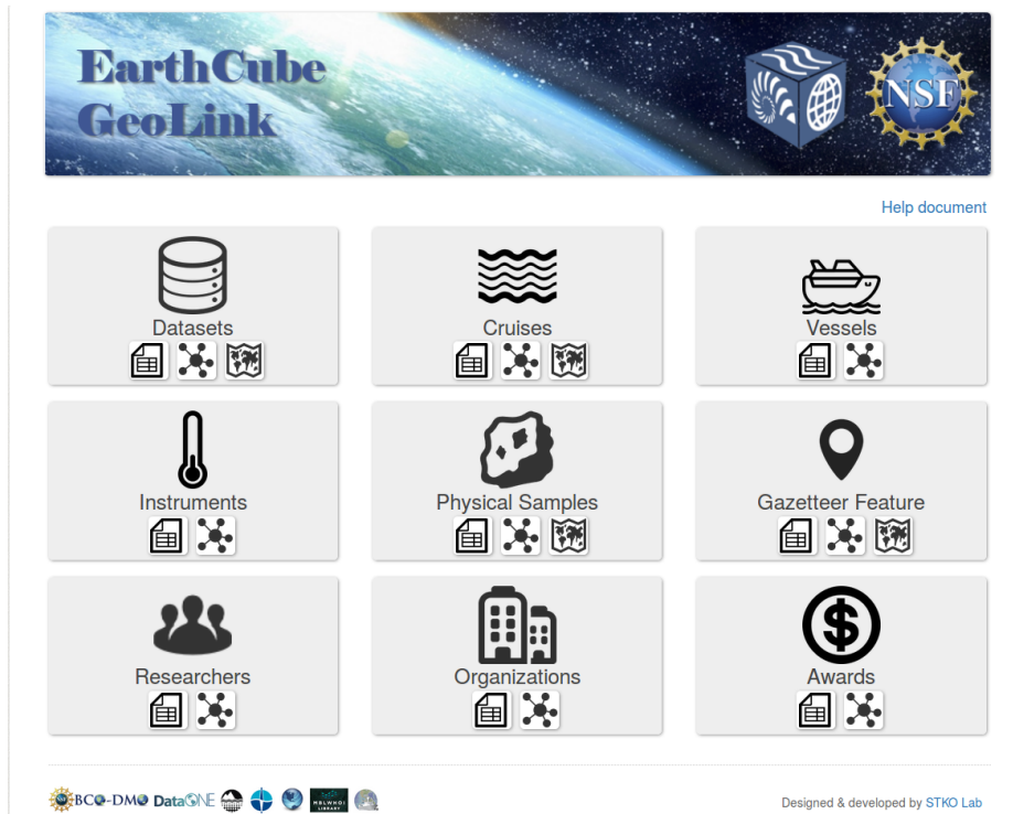
Fig. 1 The initial view of the GeoLink interface.

ence domains. However, FedViz can only support users to ask relatively simple questions which can be formalized as one federated/non-federated SPARQL query. Complex queries which require a combination of results of several different queries, like a path query over two given end nodes are not supported.